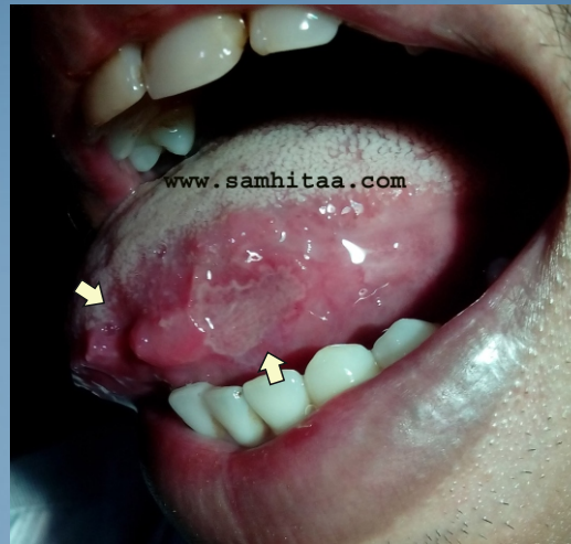
30 days follow up