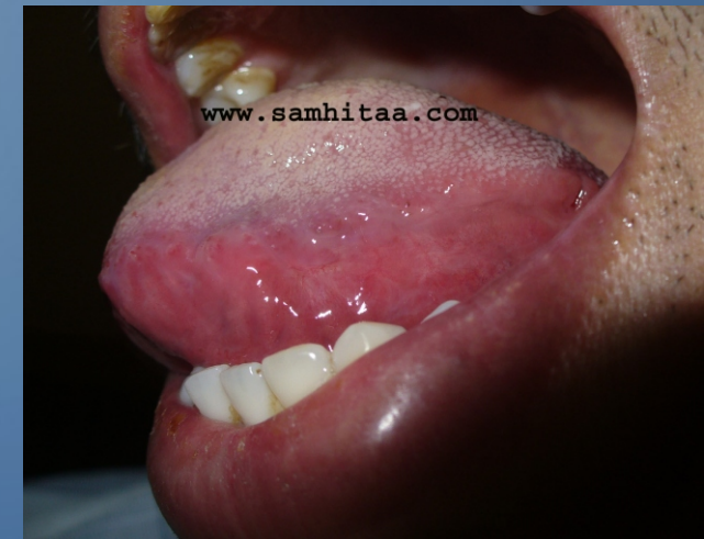
complete healing at 90 days follow up