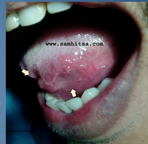
45 days follow up